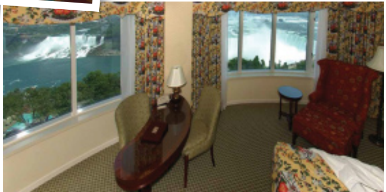
Talk about a view—you won't want to leave your room!

If you're willing to venture away from all that Niagara Fallsview has to offer, you'll find plenty of sightseeing options. Travel to the edge of the thundering Falls on the Maid of the Mist tour boat (seasonal), or experience Journey Behind the Falls (year round), a series of tunnels that pass behind and in front of the Horseshoe Falls. The Falls are illuminated nightly most of the year, an attraction in itself.