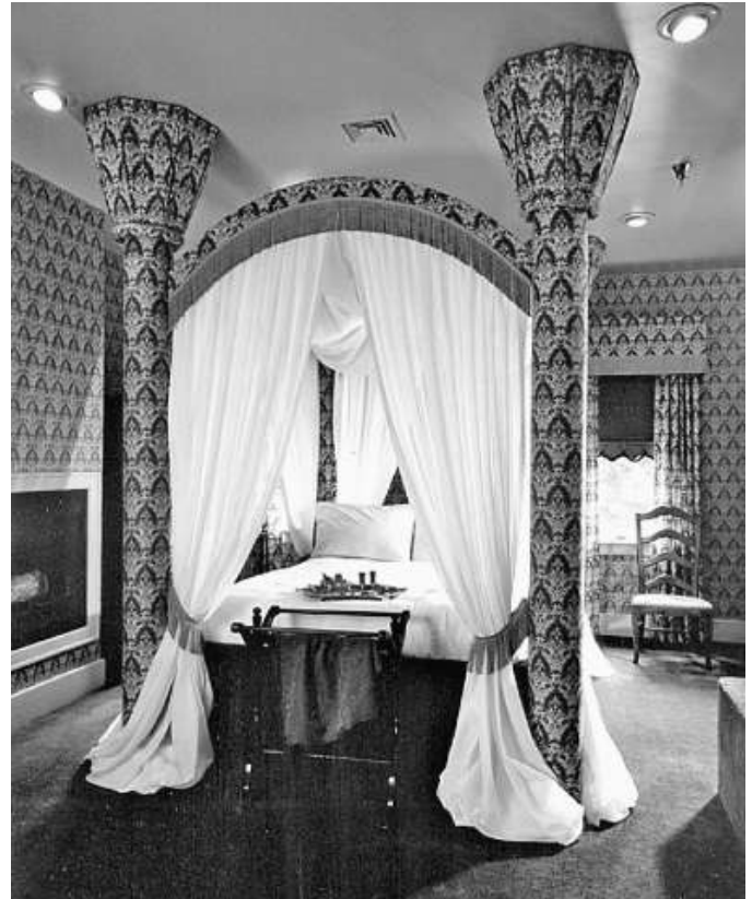
The ceiling-to-floor canopy is a stunning sight in Belle's Boudoir, one of 27 rooms in Tara, A Country Inn.

This is the final part in a three-part series on secret romantic getaways near Buffalo